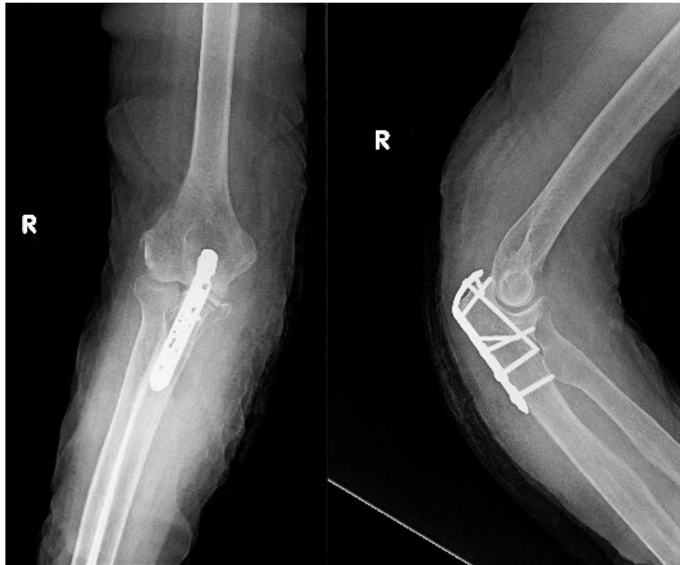
Figure 1 Locked plate fixation for olecranon fracture in a geriatric patient. Postoperative AP and lateral radiographs of an 86-year-old female patient. AP, anteroposterior.