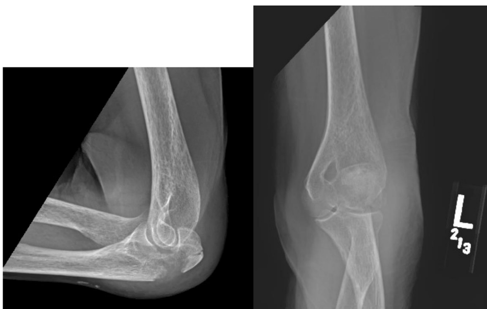
Figure 3 Mayo 2b, AO 2u1b1e. 85-year-old female presenting with a Mayo 2A (displaced, comminuted) and AO classification 2u1b1s (partial articular olecranon fracture, multi-fragmentary) olecranon fracture after a ground-level fall. AO, Arbeitsgemeinschaft für Osteosynthesefragen.

This study has several important limitations. This was a retrospective series with a small cohort of patients, many of whom had follow-up of less than 1 year. However, we surmise that the majority of these patients did not follow up longer because they were asymptomatic, having already achieved evidence of radiographic union, or had deceased, which is a reality of follow-up of elderly patients with inherent medical comorbidities. No statistical models were able to be used to identify patterns in patients with complications, major or minor, as the study was underpowered. Another area for improvement would be the inclusion of outcome scores such as the disability of the arm, shoulder, and hand (DASH), 21,26 the Mayo Elbow Score, 31 and the Broberg and Morrey score 6 to provide additional data and allow comparison with other studies.